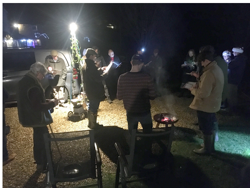
Carolling in Shepton Montague