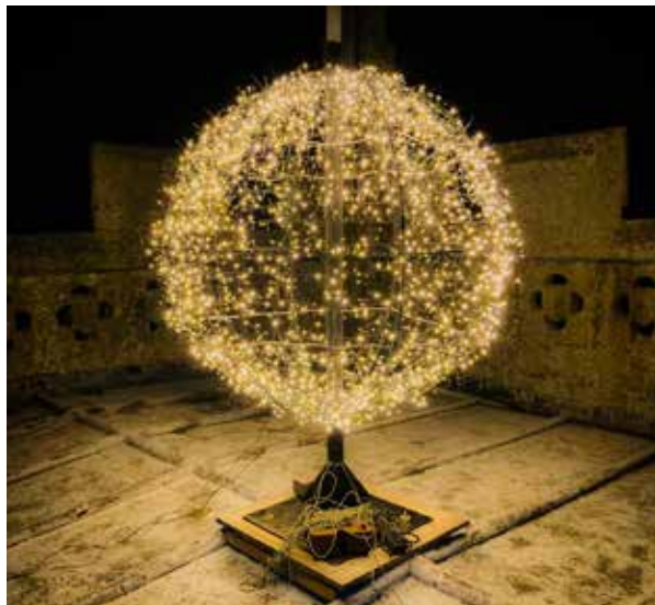
The St Mary's Star