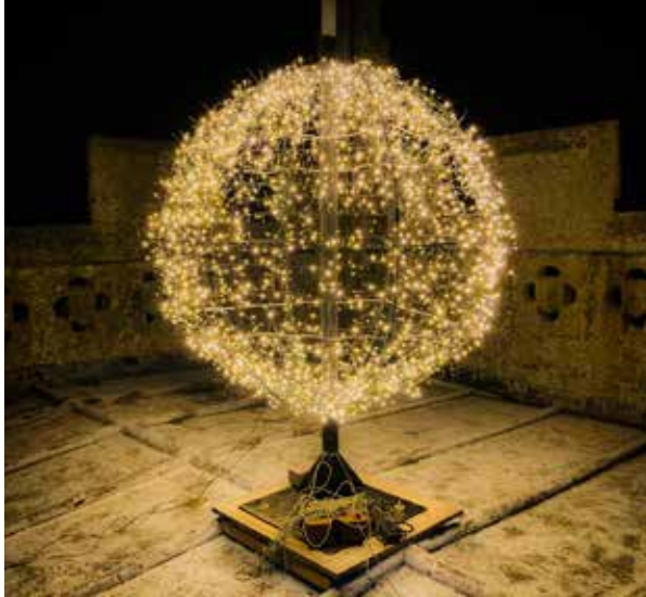
The St Mary's Star

Bruton Pitcombe Redlynch Brewham Shepton Montague Wyke Champflower